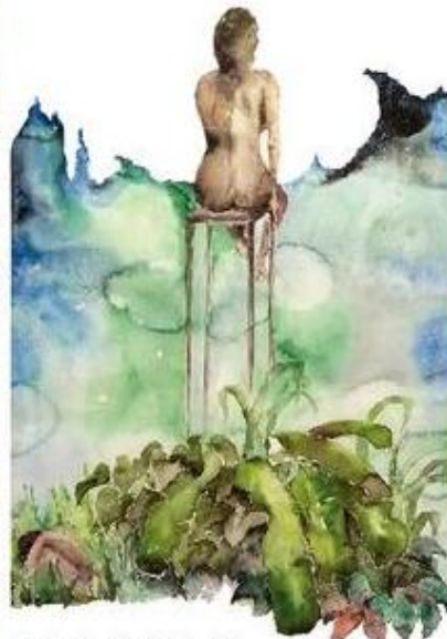
Art by Laila Vaziralli