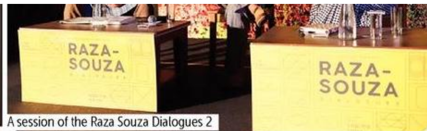
A session of the Raza Souza Dialogues 2