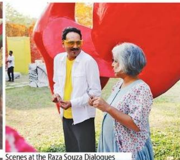
Scenes at the Raza Souza Dialogues