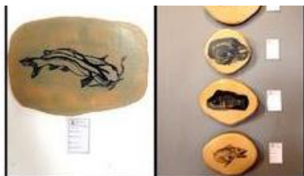
Art displayed at Carpe Diem